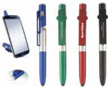
STYLUS PEN PHONE STAND $1.65 / 100 qty. | $1.50 / 500 qty. Set-Up Fee: $50 - 1 Color Imprint