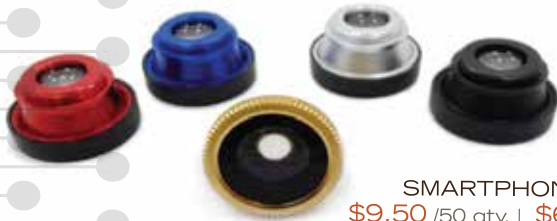
SMARTPHONE LENS KIT $9.50 /50 qty. | $6.65 /250 qty. Set-Up Fee: $35 - 1 Color Imprint