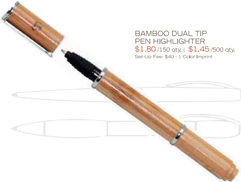
BAMBOO DUAL TIP PEN HIGHLIGHTER $1.80 / 150 qty. | $1.45 / 500 qty. Set-Up Fee: $40 - 1 Color Imprint