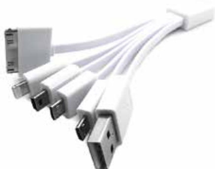
5-IN-1 CHARGING CABLE $6.85 / 50 qty. | $4.80 /250 qty. Set-Up Fee: $33 - 1 Color Imprint