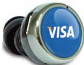
WIRELESS EARBUD HEADSET $24.50 / 24 qty. | $22 / 96 qty. Set-Up Fee: $50 -Four Color Process Imprint