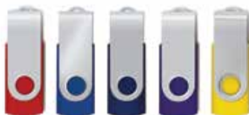
4GB USB FLASH DRIVE $5.75 / 50 qty. | $4.60 /250 qty. Set-Up Fee: $34 - 1 Color Imprint