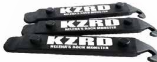
TIRE LEVERS (SET OF THREE) $1.45 / 250 qty. | $1.20 / 500 qty. Set-Up Fee: $55 - 1 Color BLACK Imprint