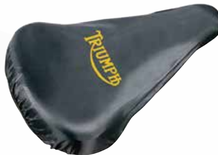
BIKE SEAT COVER $1.85 / 250 qty. | $1.25 / 1000 qty. FREE SET-UP - 1 Color Imprint