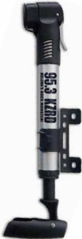
PREMIUM ALLOY BIKE PUMP $16.75 / 50 qty. | $15.50 / 250 qty. Set-Up Fee: $55 - 1 Color BLACK Imprint