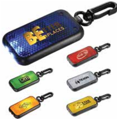
CLIP LIGHT REFLECTOR $1.60 / 200 qty. | $1.25 / 750 qty. Set-Up Fee: $50 - 1 Color Imprint