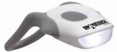
SILICON WRAP 3-PHASE BIKE LIGHT $3.50 / 100 qty. | $3.20 / 250 qty. Set-Up Fee: $45 - 1 Color Imprint