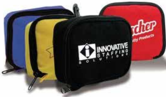
ZIPPER POUCH WITH CLIP & BELT LOOP $4.10 / 100 qty. | $3.35 / 500 qty. Set-Up Fee: $45 - 1 Color Imprint