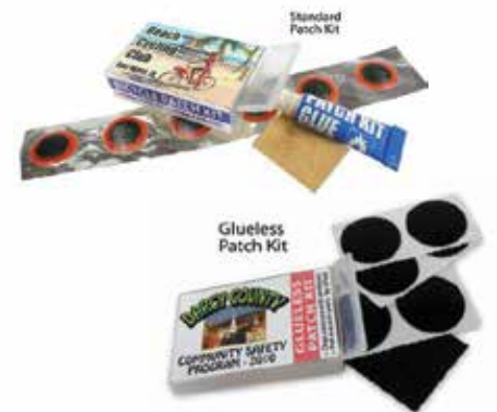
TIRE PATCH KITS $1.75 / 250 qty. | $1.50 / 1000 qty. Set-Up Fee: $50 - FULL COLOR LABEL

PLEASE NOTE ALL PRICING IS SUBJECT TO CHANGE, TAX AND SHIPPING NOT INCLUDED.