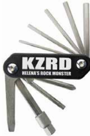
10 FUNCTION BIKE TOOL $7 / 100 qty. | $6 / 500 qty. Set-Up Fee: $55 - 1 Color PAD Imprint