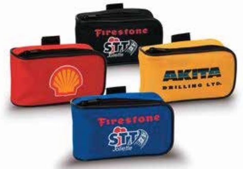
HEAVY DUTY ZIP POUCH WITH VELCRO STRAP $5.10 / 50 qty. | $4.50 / 250 qty. Set-Up Fee: $50 - 1 Color Imprint