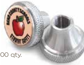
CUSTOM VALVE CAPS $4.75 / 100 qty. | $2.79 / 500 qty. Set-Up Fee: $45 - FULL COLOR DOME