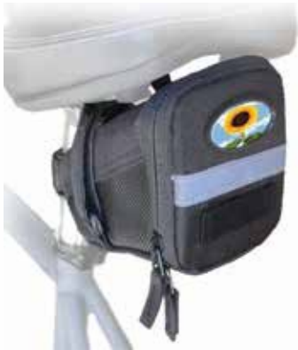
REFLECTIVE SADDLE BAG $13 / 50 qty. | $11.50 / 250 qty. Set-Up Fee: $50 - FULL COLOR DOME